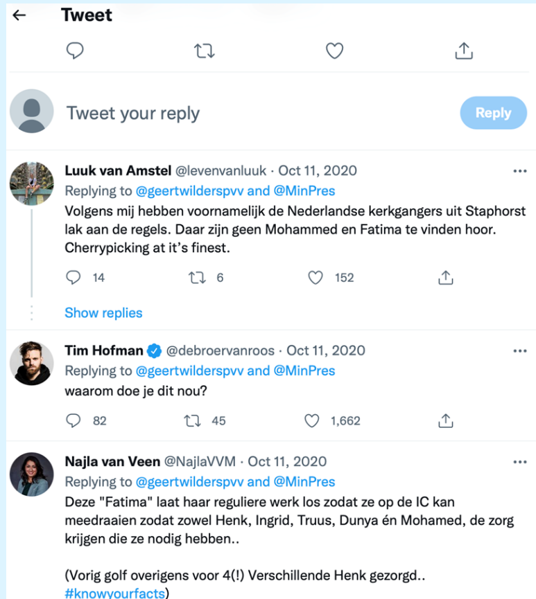
FIGURE 2 NEGATIVE REACTIONS FROM TWO TWITTERERS TO WILDERS' TWEET

Below are two comments disapproving of Wilders' tweet: