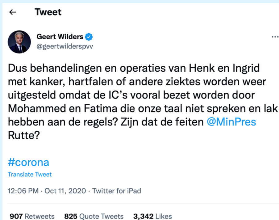
Figure 1 The Tweet of Geert Wilders