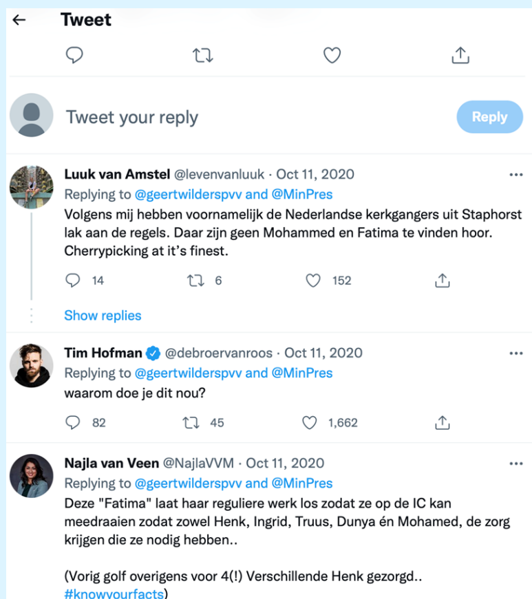
FIGURE 2 NEGATIVE REACTIONS FROM TWO TWITTERERS TO WILDERS' TWEET

Below are two comments disapproving of Wilders' tweet: