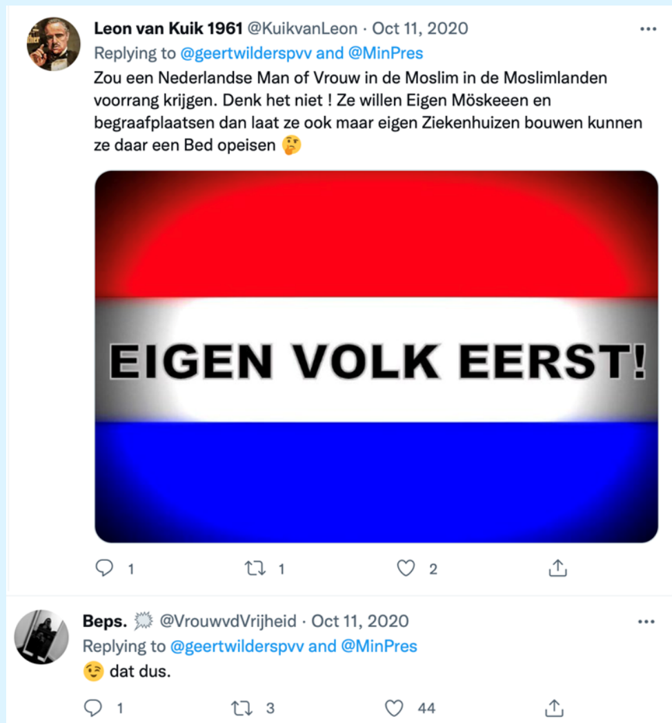
Figure 3 Supportive reactions from two tweeters to Mr. Wilders' tweet

The following screenshot shows two tweets that support Wilders' opinion .